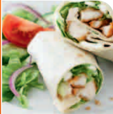
Battered chicken wrap