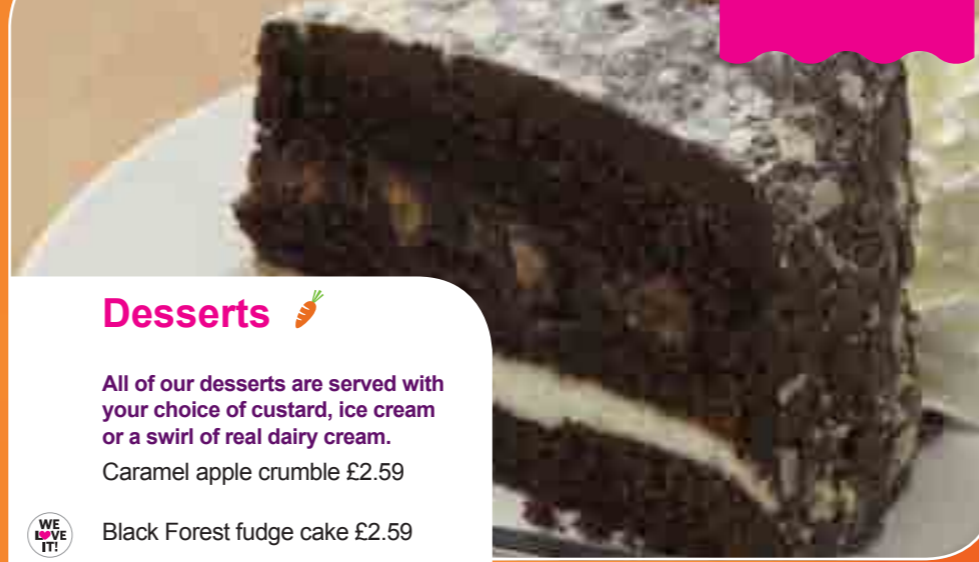
Black Forest fudge cake