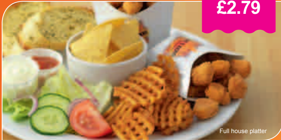
Full house platter