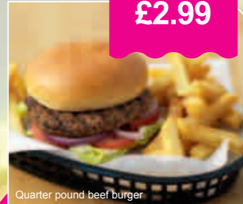
Quarter pound beef burger

With bacon, mozzarella and Cheddar cheese topped with crispy onions.