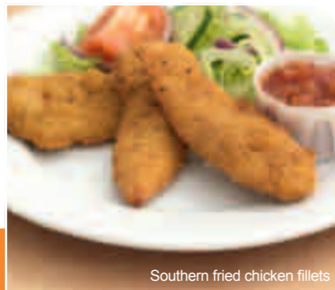
Southern fried chicken fillets

Chicken breast fillets in a southern style breadcrumb coating. Served with your choice of dip and a crispy salad garnish.