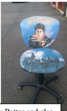
Harry Potter and also one with Sponge bob

CHECK OUT OUR Donation Page at www.stneotstimebank.org.uk Members have donated items - and we are passing on this offer to our members. No charge for many of the items, cut price for others.