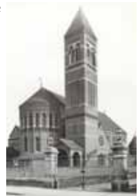
Beechen Grove Baptist Church

No booking necessary. Visit: www.bgbaptist.org.uk