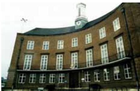
Watford Town Hall

Thursday 10 September: 2pm Booking essential.