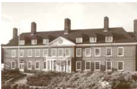
Peace Memorial Hospital

Attend a presentation on the history of the Peace Memorial Hospital and Peace Hospice, which has been serving the community for 90 years. The presentation will include historic images and oral histories, with an opportunity to share your own memories of this iconic building.