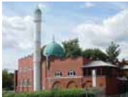
Watford Jamia Mosque

Saturday 12 September: 12.45 - 2.15pm No booking required. Visit: www.watfordmosque.org.uk