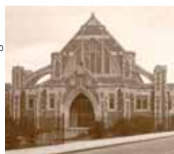
St Michael and All Angels

St Michael and All Angels Church is a very beautiful and little known Church in West Watford. Visitors will be able to have guided tours of the building, and there will also be a coffee morning taking place. St Michael's is particularly rich in memorials to the fallen of the First World War. Please be aware of roadside parking restrictions - come into Church to ask for help if necessary.