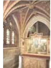
Holy Rood Church

Booking Contact: Watford Museum For more information tel: 01923 232297 Email: info@watfordmuseum.org.uk