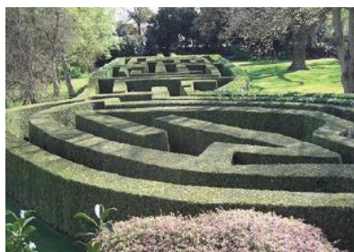
Elgood's Brewery, Wisbech

Our first Spice credits have been exchanged and I'm sure they will be used to amuse the children during the holidays at no cost to Mum and Dad.