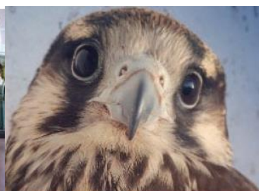
Fens Falconry Wisbech St Mary's