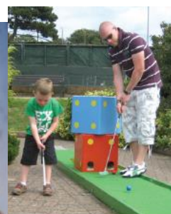
Crazy Golf Hunstanton