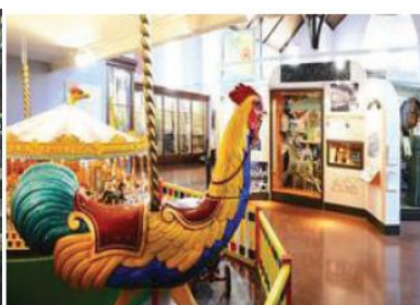
Kings Lynn Museum