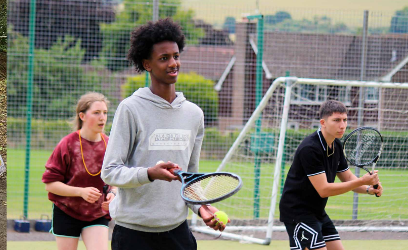
MORNING OPTION 3