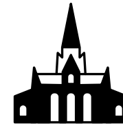
the medieval city of Salisbury