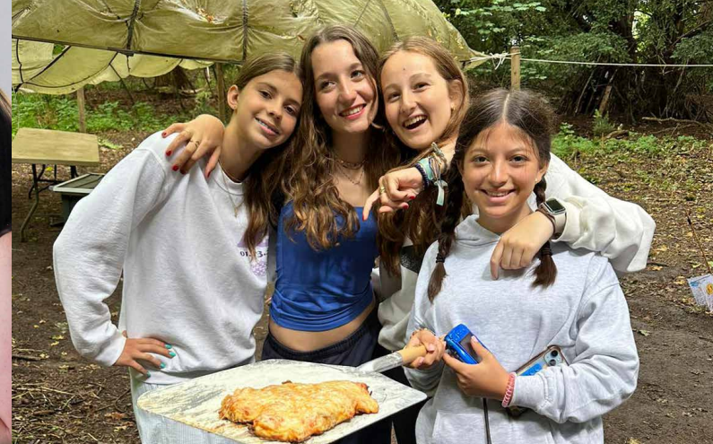
MORNING OPTION 2