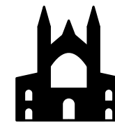
the Roman city of Bath

Our oldest campers (16-17 years old) also have the option to enjoy additional freedom and responsibility by being unaccompanied on these trips, subject to parental consent.